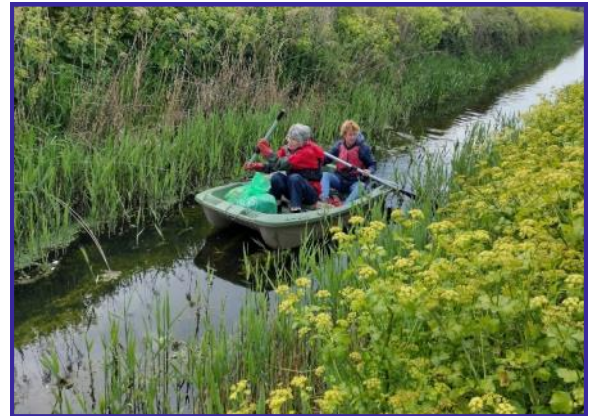
Volunteers clearing invasive parrots feather near Birchington, and below scrub clearance from Tankerton Slopes to maintain the rare hogs fennel plant.