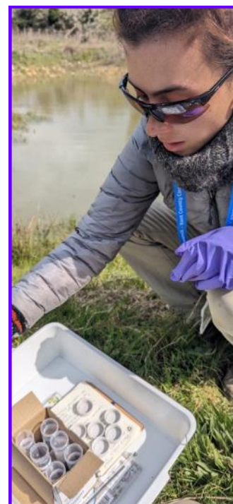
Great crested newt eDNA surveying.