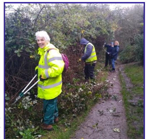
Clearing a footpath at Bishopstone, Beltinge.