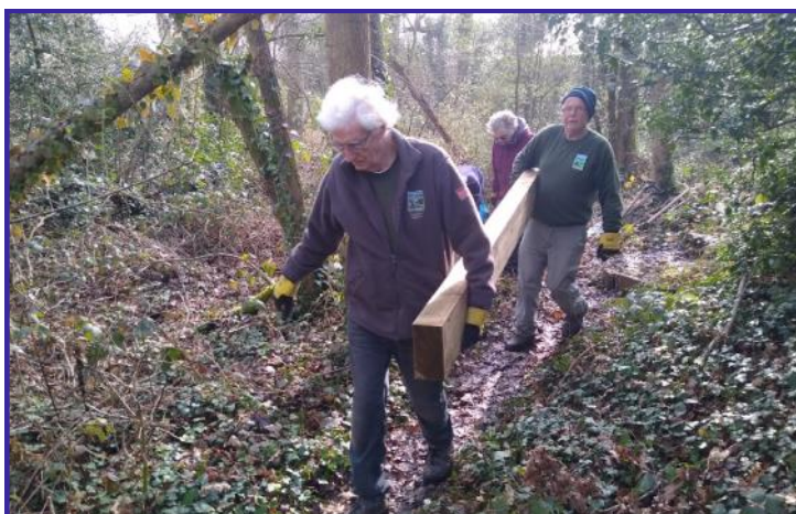
Bridge and step building at Tyler Hill Nature Reserve.

Our community work and volunteer conservation programmes offer people a range of options to get out and get healthy. Possibly the recreational walking and cycling routes, such as the Great Stour Way, which we initiate, develop and deliver, offer the greatest opportunity to stay fit and healthy. Coming into contact with nature and the outdoors has been proven to improve your health. We carried out access work with our volunteers at various sites, clearing paths and improving drainage. Volunteers also surveyed promoted routes that KSCP lead on such as the Big Blean Walk and Train Rides to Ramble. A comment from one of our tree planting days 'Thank you Andy, we enjoyed it, it was our first time and we'll definitely be doing it again next time. You're doing a great job - Vani.'