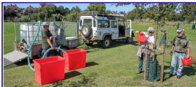
Kent Plan Tree paid for KSCP to acquire watering equipment. In use here at Kingsmead Field, Canterbury.