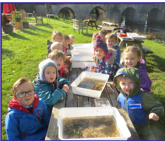
Stowting Primary School on an Our Stour Aqua lab session in Wye.