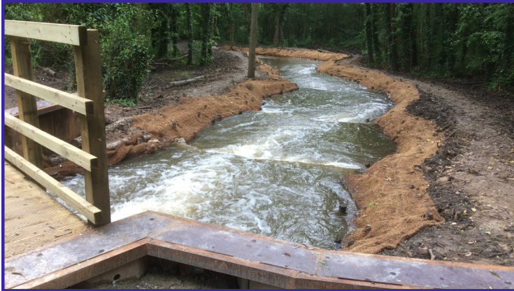
A new fish pass structure on the Chartham Crump Weir.

Work focussed on fish passage with the Buxford fish passage project completed (pic below), Sevington Mill Sluice removal, both in Ashford, and a fish pass placed on the Chartham Crump Weir. The volunteers removed hundreds of bags of litter from the river. KSCP also chair the East Kent Catchment Improvement Partnership.