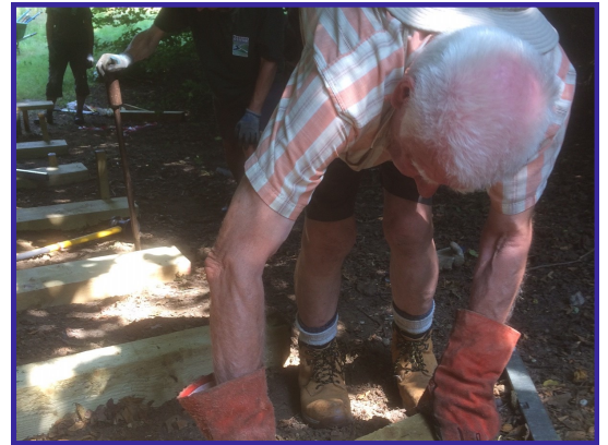
Ashford volunteers constructing steps at Boys Hall, Ashford. Below - litter taken out of the river in Ashford by volunteers from Natural England part of an Our Stour project.

1129 work days! We ran over 130 volunteer tasks and volunteers helped with school visits, events and project planning. Volunteers carried out a range of practical conservation tasks in woods, meadows and along the river. Kieran Walsh, Sturry Road Community Park ‘Just a quick note to say thank you to all of the volunteers and Annie for their hard work today. They worked exceptionally hard and made a huge difference.’