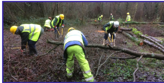
Above left, hornbeam pollard at Hatch Park, Mersham, where volunteers cleared scrub around the magnificent ancient pollards. Above, volunteers coppicing at Buxford Meadow Local Wildlife Site.