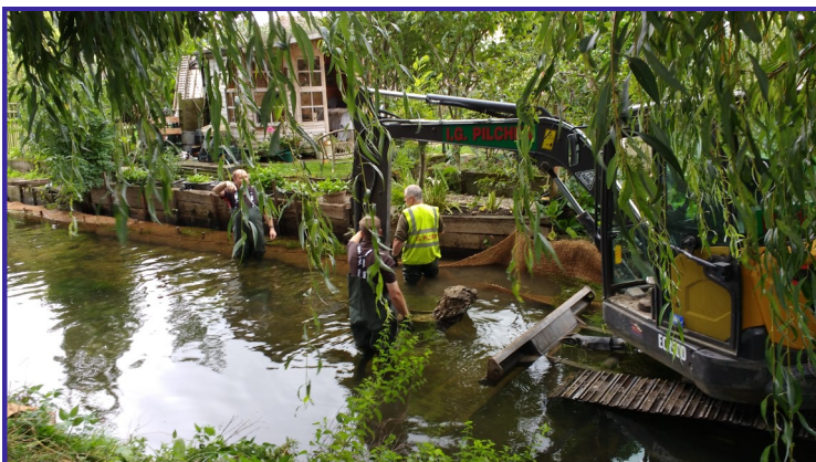
Improving river habitat in Canterbury, above, and volunteers removing Himalayan Balsam.

Included major river habitat enhancements in Canterbury and on the Wingham River, and volunteers removed hundreds of bags of litter from the river. KSCP also chair the East Kent Catchment Improvement Partnership.