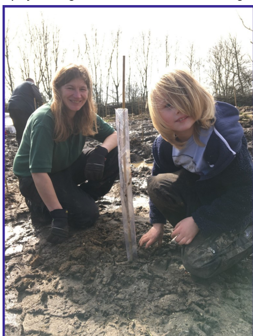
Planting trees as part of the Caldecott College natural green barrier project with Environment Agency staff.