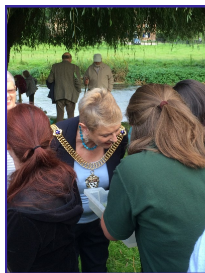
Mayor of Canterbury Rosemary Doyle looking at river invertebrates on the Our Stour launch day at Godmersham Park.