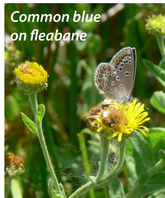
Common blue on fleabane

In the meadow are lots of 'ecological niches' where particular plants thrive - meadow vetchling prefers the drier areas, while fleabane and water mint take over on damp ground. Purple loosestrife and water forget-me-not grow in the shallow pond margins, while yellow water-lily is fully aquatic, floating in the water. The pond is brimming with aquatic insects, and amphibians. Grass snakes hunt around the pond and may even be seen swimming across the water. However, humans should keep their distance, as there are invasive plants here that can easily be transported on boots to other sites!