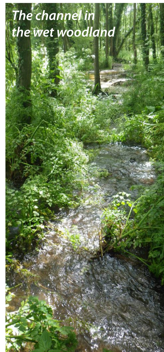
The channel in the wet woodland