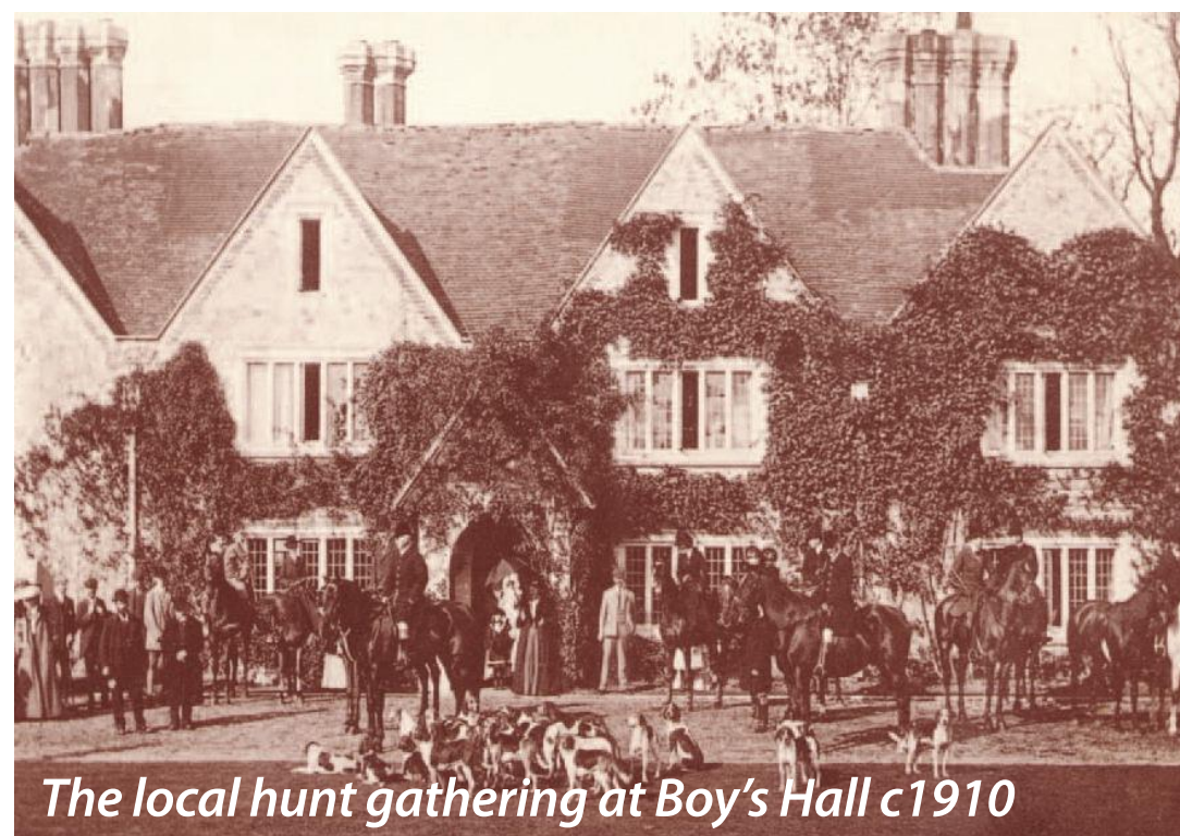
The local hunt gathering at Boy's Hall c1910

Recycling isn't new! In 1632, when Thomas Boys was extending Boys Hall (which stands in front of you) he used materials from the remains of an abandoned medieval house that he owned nearby. The old house occupied the island formed by the historic Boys Hall Moat, and the story goes that he had the building demolished after a child drowned in the moat.