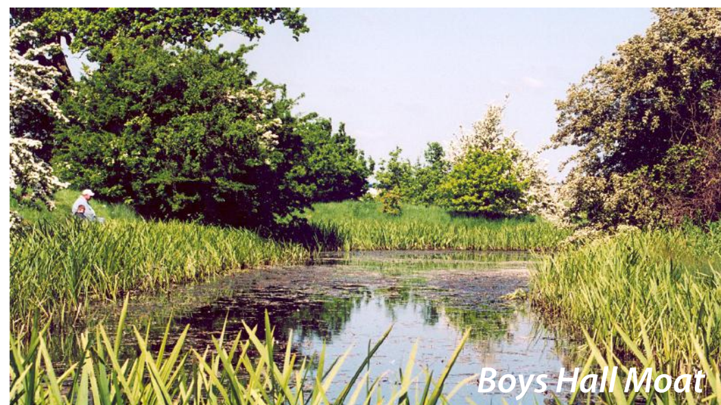
Boys Hall Moat

The Boys family lived at Boys Hall for many years, and were wealthy farmers and landowners. It's said they were also involved in smuggling, as many of the landed gentry were at that time! If you catch a glimpse of a spectral figure, don't be surprised – the house has its fair share of ghosts, including a drunk who enjoys dancing round the dining room!