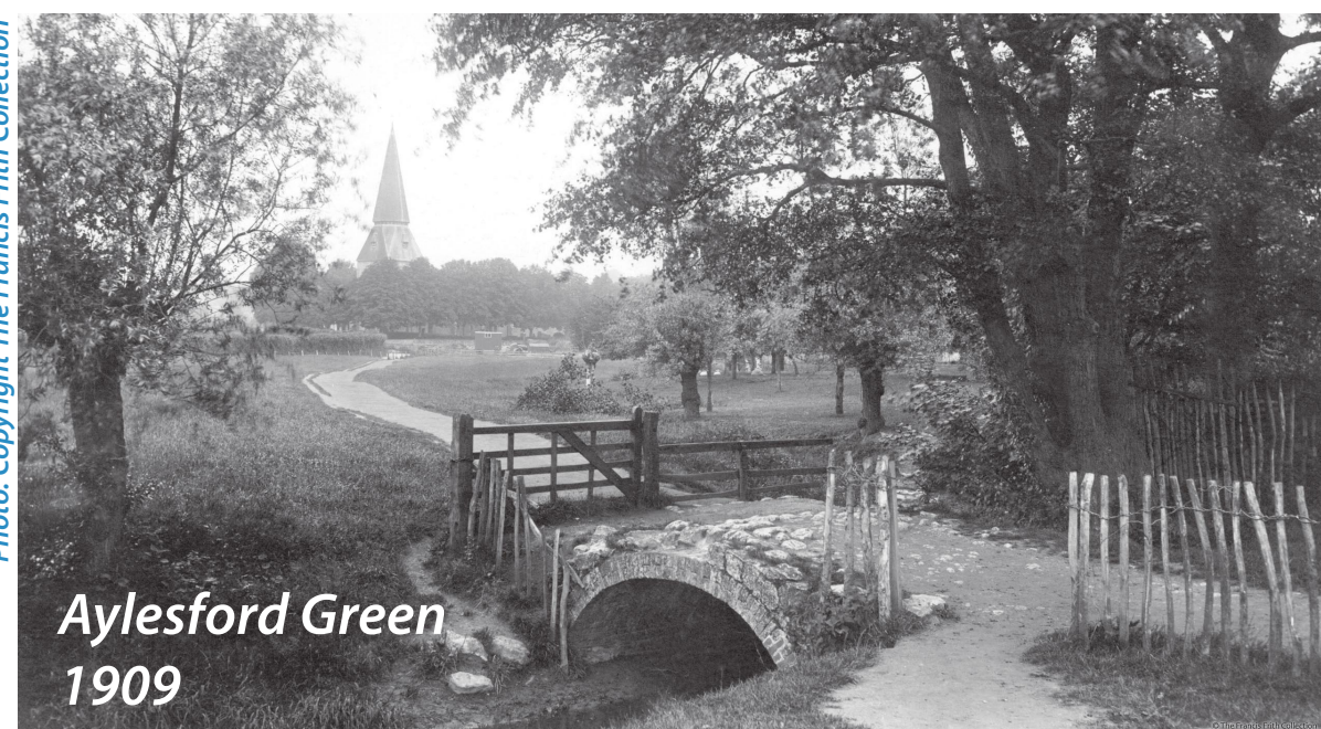
Aylesford Green 1909