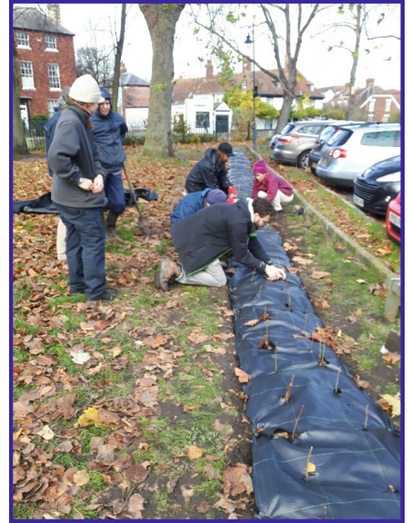
Volunteers planting a hedge at Miller's Field, Canterbury and litter picking, below.

1153 work days! We ran over 130 volunteer tasks and volunteers helped with school visits, events and project planning. Volunteers carried out a range of practical conservation tasks in woods, meadows and along the river.