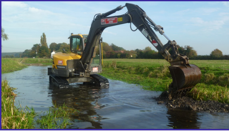
Improving river habitat at Seaton, near Wickhambreaux, and volunteers installing river marginal plant boxes in Westgate Gardens, Canterbury.

Included major river habitat enhancements, continued control of invasive Himalayan balsam and volunteers removed hundreds of bags of litter from the river. KSCP also chair the East Kent Catchment Improvement Partnership.