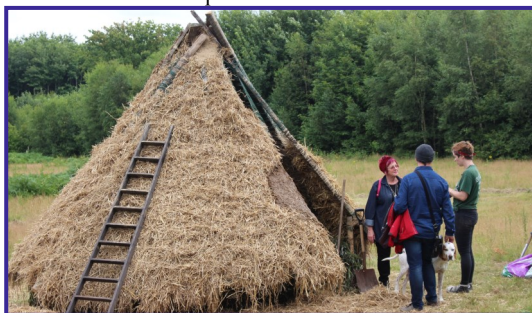
Liz Pallister's sculpture.