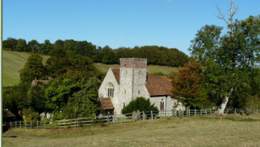
The Church from the south-west.

Written and designed by Clarity Interpretation www.clarity-consultancy.co.uk