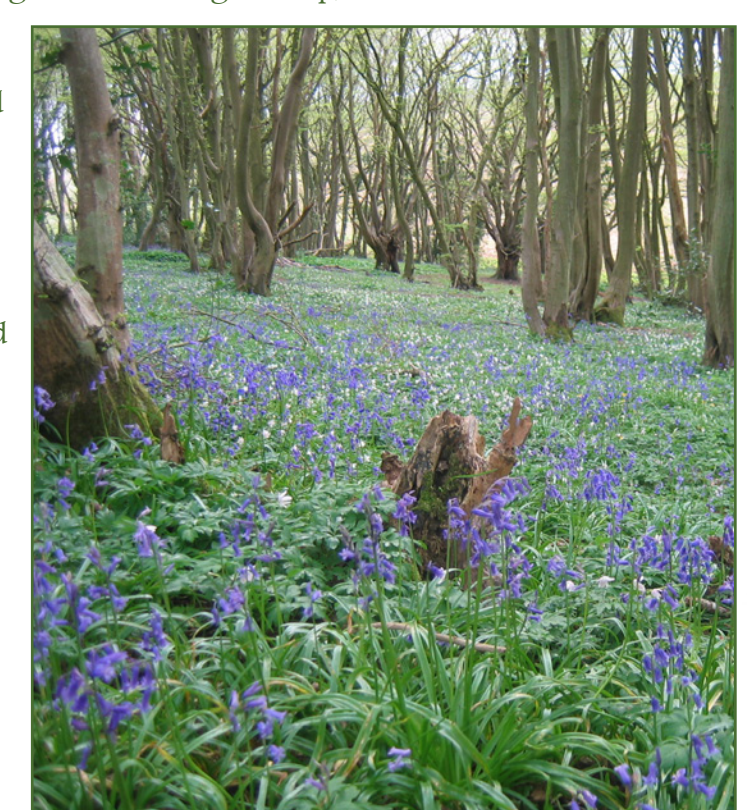
Bluebells and wood anemone in ancient woodland.