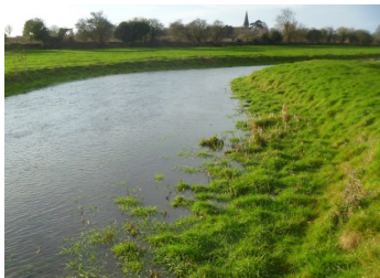
Left: The Little Stour at Seaton as it is currently

The river banks will be fenced to prevent cattle grazing. This will allow wild plants to grow in the water and on the banks, providing better habitat for wildlife - fringing plants, for example, are a refuge for juvenile fish. The river alongside Nargate Street gives an idea of what it is eventually likely to look like .