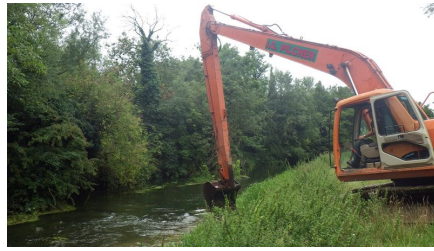
River restoration project in progress on the Stour near Chartham

Using a mechanical excavator we are going to dig a series of pools into the river bed and place the gravel which is removed onto the edges of the river. This will create a narrower, deeper, winding channel during summer when the water level is low. Passage will become easier for fish and a more varied habitat will develop for all aquatic wildlife. Deeper water will also be cooler in the hotter temperatures expected with climate change over the coming decades.