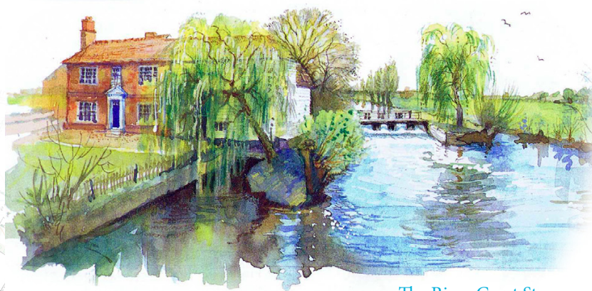
The River Great Stour