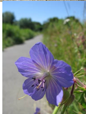
Meadow cranesbill. One of many wildflowers sown alongside the Great Stour Way by KSCP volunteers at Hambrook in 2011, flourishing in 2014.