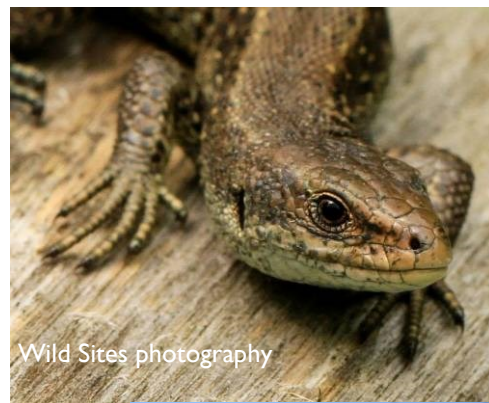
Wild Sites photography

Various free walk and cycle maps. Available from Tourist Information Centres.