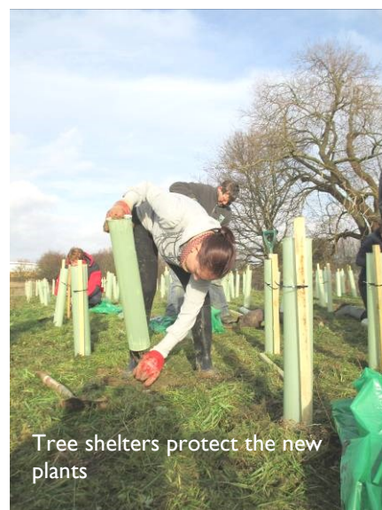
Tree shelters protect the new plants

The careful planning and dedication to endangered species protection throughout this work has demonstrated that 'wild' life can co-exist in today's urban framework and cyclists using the new path can do so in the safe knowledge that their sleepy friends have a safe future too.