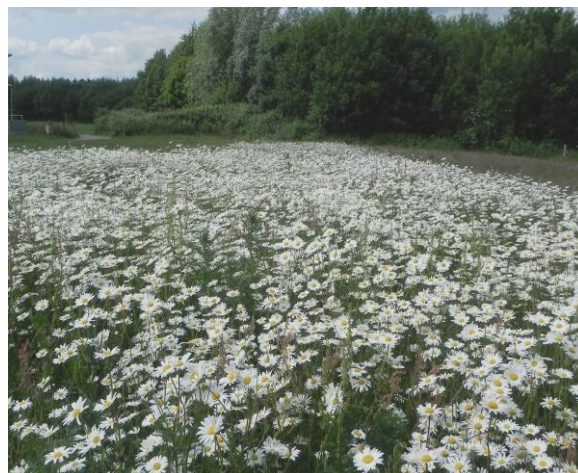
Working towards a wildflower meadow similar to this one planted in 2012 at Little Burton

South Park Meadow covers an area approximately 8000 sq. metres in which the ground level has been lowered and sown with a native wet-meadow seed mix. The East Stour river banks have been altered to improve flow conditions and river habitat and a new earth bank has been formed along the site edge. This winter a 180 metre hedge will be planted along this bank by KSCP volunteers. The work will benefit wildlife, reduce flood risk, add value to the landscape and improve water quality. Once established the recreated flood meadow, which includes several scrapes (shallow depressions that seasonally hold water to provide habitat for a range of species such as dragonflies), should be awash with wildflowers and waving grasses in spring and summer - excellent for insects and birds and an important nectar source for bumble bees and other pollinating insects. Due to be opened to the public in the Spring of 2015, South Park Meadow will be a beautiful and peaceful space for local residents and visitors to the town whilst providing a valuable area for storing floodwater during the winter months. This is a partnership project between KSCP, the Environment Agency, Ashford Borough Council and Kent County Council.