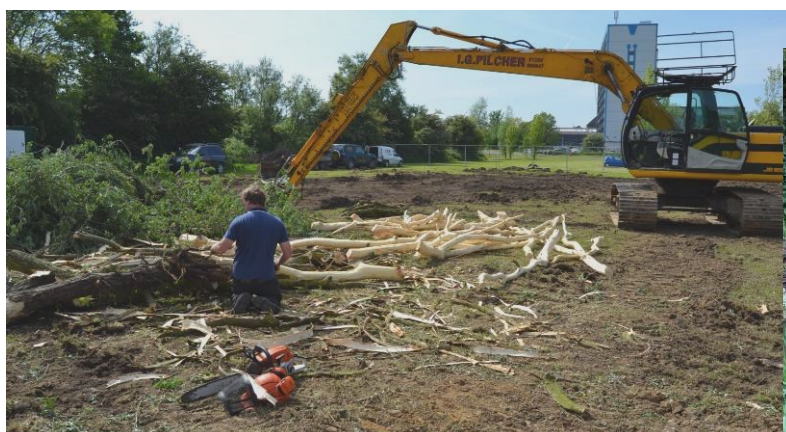
River bank works, improving flow and wildlife habitat