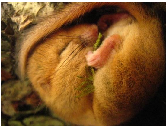
The hazel dormouse ( Muscardinus avellanarius ) sleeps through the daytime and forages at night