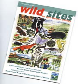
Wildsites (£1.00) A guide to 31 wildlife sites in the Stour Valley

All available from local Tourist Information Centres, quality bookshops, KSCP, and Kent County Council (08458 247600 or env.publications@kent.gov.uk)