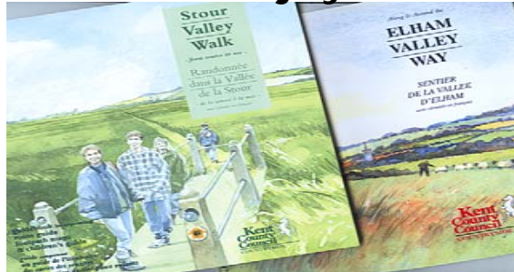
Stour Valley Walk & Elham Valley Way (£5.00) Recreational walks produced by Kent County Council with help from KSCP.