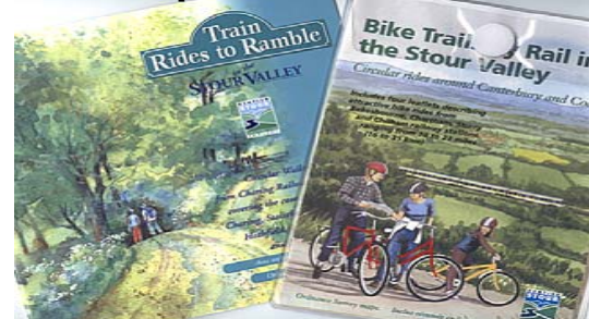
Train Rides to Ramble (£2.00) & Bike Trails by Train (£1.50) Circular walks and cycle rides from railway stations in the Stour Valley. Full colour, clear maps and directions, packed with information and illustrations.