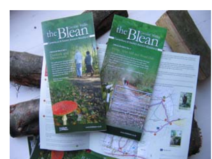
The new leaflets

Canterbury is surrounded by special ancient woodland and protected landscapes and has the only major river in East Kent flowing through the city. The River Great Stour is a beautiful asset for the area and is designated as a Local Wildlife Site. The most important wildlife site along the river is Stodmarsh National Nature Reserve, being a premier reedbed AND URBAN GREEN SPACE OF THE habitat. Between Canterbury, Reculver and Sandwich is the old Wantsum Channel, reclaimed from the sea, with pretty villages lining what used to be the old shoreline.