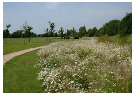
Wildflower meadow creation in the Ashford Green Corridor, supported by funds from RLCI