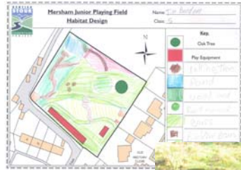
TOP: One of the children's designs RIGHT: A young ecologist at work