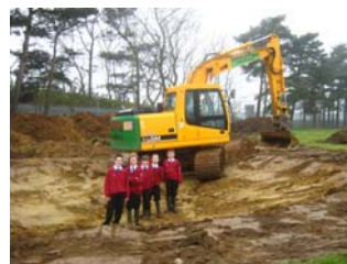
Students inspect the new pond

The North School with its positive focus on encouraging understanding and enjoyment of rural skills, has taken a further step into the green classroom. With funding from RLCI, KSCP and the school, a large wildlife area incorporating a pond and wildflower meadow has been created. This outdoor classroom provides a vital opportunity for students to study fundamental understanding of life cycles, food chains and advance their knowledge of ecological principals. The wildlife area, combined with the existing school farm, has formed a landscape that typifies the wider environment, thus producing a realistic and safe learning zone for the students. The project, managed by KSCP and carried out by local contractors, has been closely followed by students at the school.