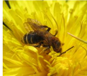
Wildlife thrives on the wetland trail

A walk taking in a range of habitats including woodland, farmland, wetland and lakes has been opened to the public at the Evegat Business Centre, Smeeth. An interpretation panel, located in the main shopping area, provides fascinating details of the wildlife that thrives on the site. The walk is very enjoyable and through the warmer months flowers including ragged robin brighten the pathway. Buzzards are often seen freely gliding above the woodland too. For more information on the site, or to get a free leaflet please call the Evegat Business Centre directly or KSCP.