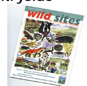
Wildsites (£1.00) A guide to 31 wildlife sites in the Stour Valley

All available from local Tourist Information Centres, quality bookshops, KSCP, and Kent County Council (08458 247600 or env.publications@kent.gov.uk)