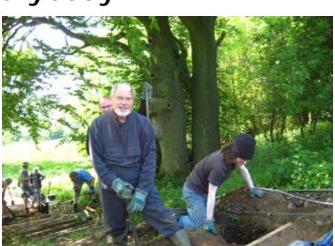
KSCP volunteers at work