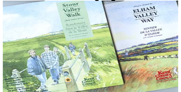
Stour Valley Walk & Elham Valley Way (£5.00) Recreational walks produced by Kent County Council with help from KSCP.