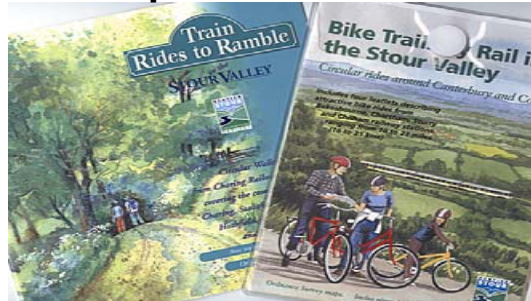
Train Rides to Ramble (£3.99) & Bike Trails by Train (£2.50) Circular walks and cycle rides from railway stations in the Stour Valley. Full colour, clear maps and directions, packed with information and illustrations.