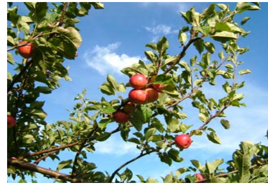
No Mans Orchard

Visit the Historical Rural Life Collection - King's Wood, main car park. Sun. 6th July 10.30am-12.30. Friends of King's Wood £2 to non members. Booking Essential. Further details 07523 203458