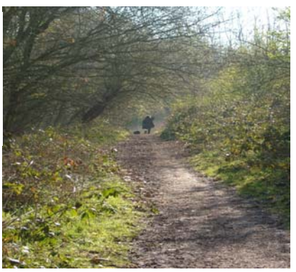
The North Downs Way