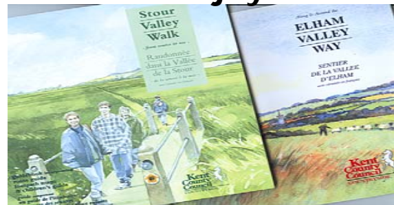
Stour Valley Walk & Elham Valley Way (£5.00) Recreational walks produced by Kent County Council with help from KSCP.