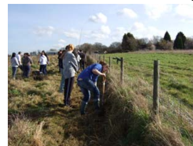
Canterbury College hedge planting

Wraik Hill and Foxes Cross Local Nature Reserve has seen a lot of the KSCP volunteers recently. The reserve near Whitstable is undergoing some improvements made possible by a £12,431 grant from Viridor Credits. Working with Canterbury City Council and the Kent Wildlife Trust, it is hoped that goats will be grazing the site this winter. Grazing animals are often used as a conservation management tool, they can graze areas that are impossible to mow. The goats will hopefully maintain the floristic importance of the site, stopping it from reverting to scrub. This in turn will allow more butterflies and birds and many other species to colonise. The KSCP have already planted a hedge. Other work planned for the project includes major scrub clearance with a machine, and the creation of a pond.