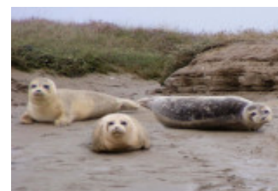
Seals from the Sandwich River Bus

Viridor Waste Management Ltd is the name of the company that took over the Shelford Landfill Site to the east of Canterbury from Brett in 2006. Viridor Credits operates the Landfill Communities Fund which provides grants for environmental or community projects such as improving green spaces or village halls. Funding is usually limited to £20,000 but in special circumstances groups can apply for more. Projects have to be within a 10 mile radius of the Shelford Landfill Site, which therefore includes the whole of the Canterbury District and the fringes of all the neighbouring Districts. For further information tel: 01823 327221 or visit www.Viridor-Credits.co.uk .