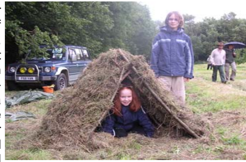
An event at No Man's in 2006

'60 years on' is the title of the event to celebrate No Man's Orchard 60 th year since its planting. The orchard near Chartham Hatch, primarily consists of large Bramley trees, is a Local Nature Reserve and a Community Orchard. The event will highlight the importance and value of traditional orchards, not only for heritage reasons but also for the wide variety of wildlife that rely on these orchards. There will be lots to see and do with demonstrations, including a full size cider press; information on the wildlife of traditional orchards; a photo display of the orchard through its history; games and activities for the whole family; live entertainment from the Canterbury Brass Band, and Oyster Morris. Food and drink will be for sale including a hog roast, local cider and juices from Tiddley Pomme, and local ales provided by the Campaign for Real Ale (CAMRA). The day will also include the unveiling of a new sculpture which will sit in the orchard for years to come. The event is being organised by No Man's Orchard Management Committee. Further information from KSCP.