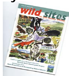
Wildsites (£1.00) A guide to 31 wildlife sites in the Stour Valley.

All available from local Tourist Information Centres, quality bookshops, KSCP, and Kent County Council (08458 247600 or env.publications@kent.gov.uk)