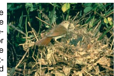
Nightingale at Wraik Hill

Wraik Hill and Foxes Cross Local Nature Reserve has seen a lot of the KSCP volunteers recently. The reserve near Whitstable is undergoing some improvements made possible by a £12,431 grant from Viridor Credits. Working with Canterbury City Council and the Kent Wildlife Trust, it is hoped that goats will be grazing the site this winter. Grazing animals are often used as a conservation management tool, they can graze areas that are impossible to mow. The goats will hopefully maintain the floristic importance of the site, stopping it from reverting to scrub. This in turn will allow more butterflies and birds and many other species to colonise. The KSCP have already planted a hedge. Other work planned for the project includes major scrub clearance with a machine, and the creation of a pond.