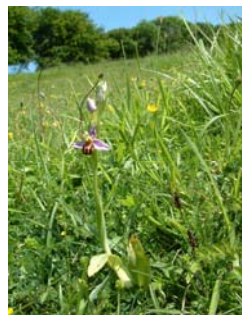
Bee orchid at Jumping Downs