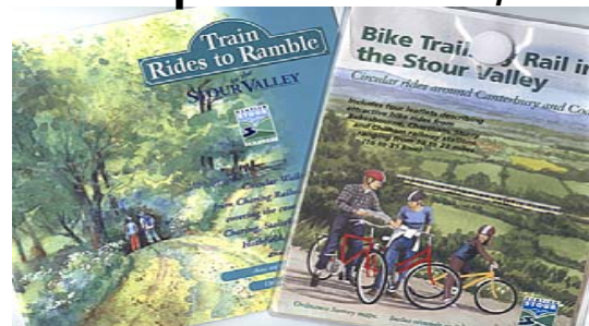
Train Rides to Ramble (£3.99) & Bike Trails by Train (£2.50) Circular walks and cycle rides from railway stations in the Stour Valley. Full colour, clear maps and