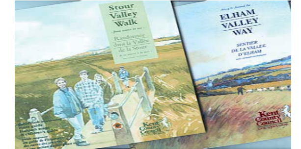
Stour Valley Walk & Elham Valley Way (£5.00) Recreational walks produced by Kent County Council with help from KSCP