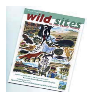
Wildsites (£1.00) A guide to 31 wildlife sites in the Stour Valley.