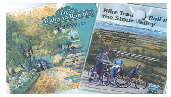
Train Rides to Ramble (£3.99) & Bike Trails by Train (£2.50) Circular walks and cycle rides from railway stations in the Stour Valley. Full colour, clear maps and directions, packed with information and illustrations.