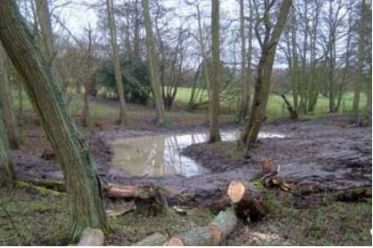
Creation of a woodland pond adds habi-