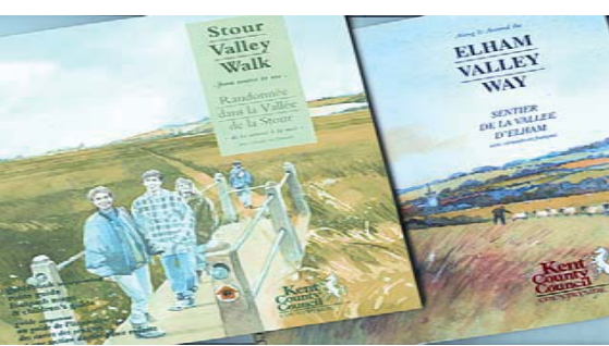
Stour Valley Walk & Elham Valley Way (£5.00) Recreational walks produced by Kent County Council with help