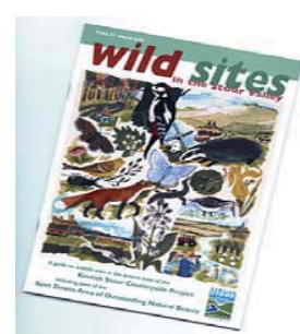
Wildsites (£1.00) A guide to 31 wildlife sites in the Stour Valley.

All available from local Tourist Information Centres, quality bookshops, KSCP, and Kent County Council (08458 247600 or env.publications@kent.gov.uk).