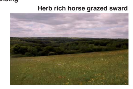
Brown argus larva requires foodplants such as common rock rose