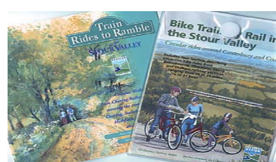
Train Rides to Ramble (£3.99) & Bike Trails by Train (£2.50) Circular walks and cycle rides from railway stations in the Stour Valley. Full colour, clear maps and directions, packed with information and illustrations.