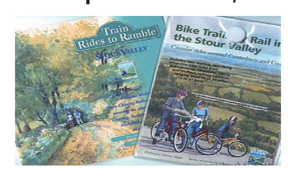
Train Rides to Ramble (£3.99) & Bike Trails by Train (£2.50) Circular walks and cycle rides from railway stations in the Stour Valley. Full colour, clear maps and directions, packed with information and illustrations.