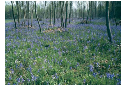
Bluebells at King's Wood

Bluebell walk - King's Wood Car Park - Sat 26th April 10.00-12.00am. Friends of King's Wood. £2 to non members