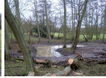
Creation of a woodland pond adds habitat diversity