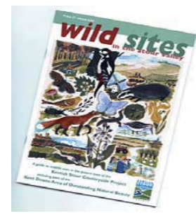
Wildsites (£1.00) A guide to 31 wildlife sites in the Stour Valley.

All available from local Tourist Information Centres, quality bookshops, KSCP, and Kent County Council (08458 247600 or env.publications@kent.gov.uk).