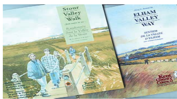
Stour Valley Walk & Elham Valley Way (£5.00) Recreational walks produced by Kent County Council with help from KSCP