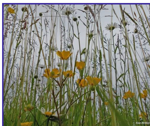
A picture taken at Hambrook Marshes