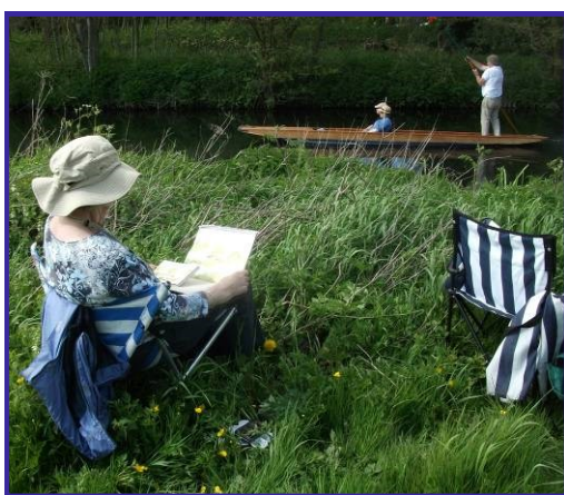
A painting workshop, part of Wildsites events.

With our help Canterbury City Council were successful with an application to the Heritage Lottery Fund for a £770,000 grant for a five year project in Westgate Parks improving infrastructure, planting and community engagement. Through KSCP a Westgate Park Community Development Officer started in November and has amongst other things established an events programme for 2014/15. Our Wildsites on Your Doorstep Project has involved over 400 people on 20 sites across the Stour Valley. Working with the Crab and Winkle Line Trust we produced 50,000 copies of the fifth Crab and Winkle Way leaflet.