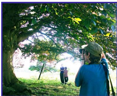
A Wildsites photography project.

Worked on nine sites in the Kent Downs AONB , planting a hedge at Charing Alderbed Meadow, cutting scrub at Jumping Downs, Barham, and coppicing a hedge for a landowner at Anvil Green, Crundale. Our Wildsites Project (see below) visited sites in the AONB.