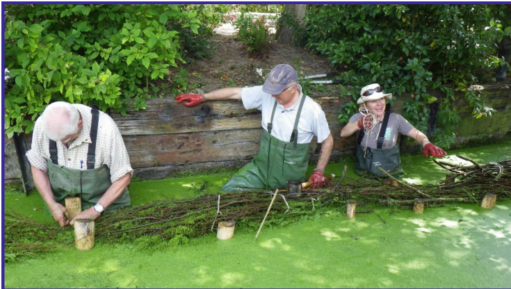
Work at South Poulders, Sandwich.

Carried out river habitat enhancements at Godinton and on drainage channels in Smeeth, South Poulders near Sandwich, Whitehall Meadows (Canterbury) and Loudon Wood (Ashford).