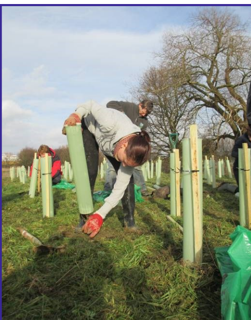
We advised on dormouse mitigation resulting in the planting of 3800 trees by volunteers for the Park Farm to Ashford cycleway.