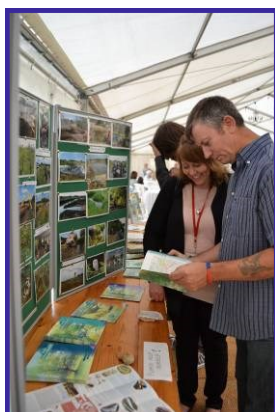
Givaudan held a 50th year celebratory event at which KSCP attended.