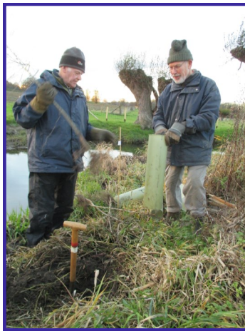
Tree planting alongside the river at Godinton.