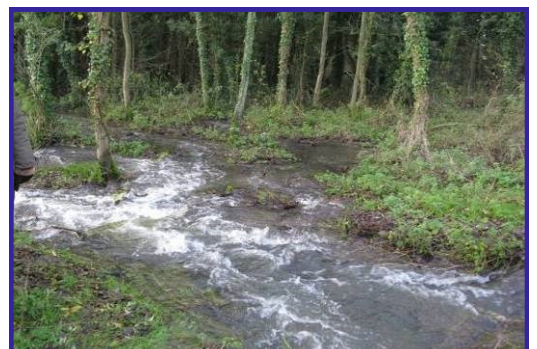
Buxford Meadow where a report was done on improving fish passage by creating a new channel avoiding structures in the river.

Carried out 15 advisory visits to new sites in addition to advice and support on existing sites. We became the advisory body in our area for the B&Q sponsored south-east focussed Good Woods Project co-ordinated by Sylva and the Kent Downs AONB, carrying out nine advisory visits with reports. Produced three river restoration reports for the Environment Agency and two reports for smaller drainage channels for KCC. We successfully bid for funds to research flood areas, run training courses for land managers related to flooding and carry out work to prevent flooding. Worked with approximately 50 farmers/landowners giving advice, writing recommendations, carrying out surveys and management.