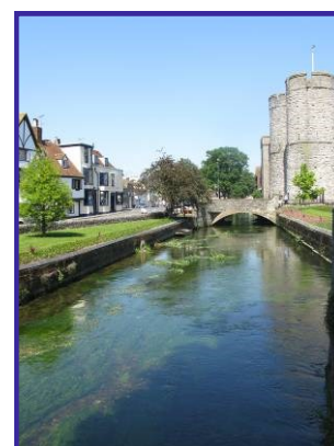
Westgate Gardens, part of Westgate Parks.