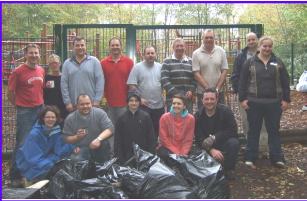
Residents from around Loudon Wood, Ashford come together to carry out conservation work.

Supported 26 site based community groups with practical help managing their land. Worked with a new group in Canterbury, the Friends of Canterbury Riverside and other resident groups with an interest in the river to develop projects. Supported the Friends of Westgate Parks at numerous meetings and established a new Saturday morning volunteer group for the Parks. Helped the Heath Countryside Corridor (HCC) Group west of Ashford.