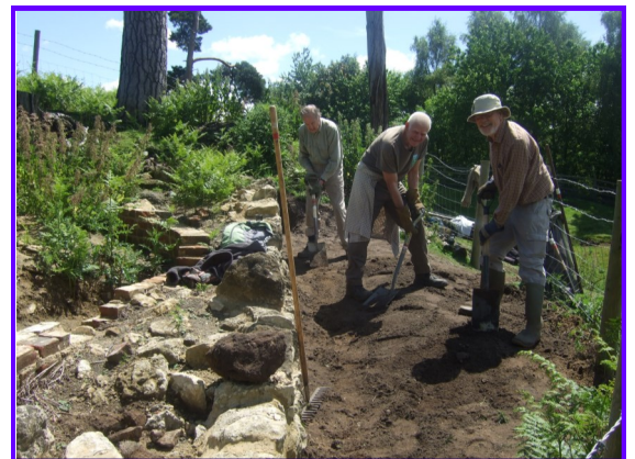
Work on landscaping around the Ice House at Chilston, Lenham for the HCC group.