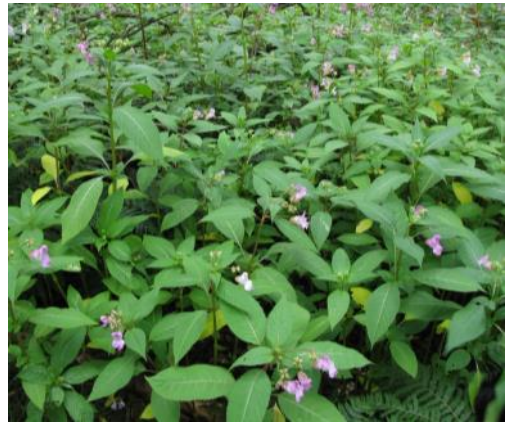
Himalayan balsam Probably the species you are most likely to see