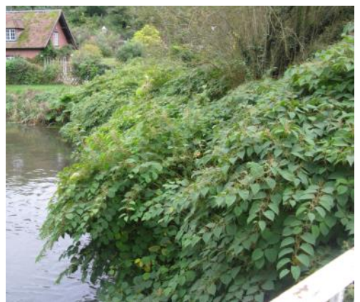
Japanese knotweed Can also cause damage to buildings.

These are plants or animals which are not native to Britain and can take over natural habitats. Some aliens like to grow in or near ditches or rivers. If you see any of the plants in these pictures, please report them to your local council (contact details inside).