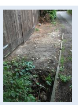
Ditch covered over to create rear access to property - this would require permission.

Ashford Borough Council: 01233 331111 www.ashford.gov.uk Canterbury City Council: 0800 031 9091 www.canterbury.gov.uk